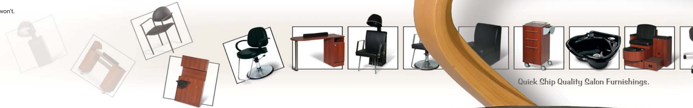
Quick Ship Quality Salon Furnishings.

Speed. Support. Service. That's what you'll get from the second generation of Belvedere Preferred Stock. We've identified our most popular salon and spa products and made them available to you in a quick shipment program. Belvedere understands your business and we know you don't have time to wait for quality furniture and equipment. And thanks to Belvedere Preferred Stock 2 you won't.