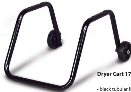
Dryer Cart 17009B