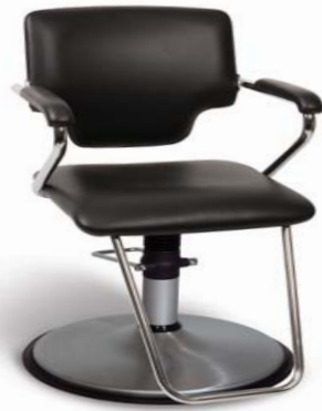
Belle All-Purpose Chair PSBL81-BL

22"(W) x 33-1/2"(D) x 34"(H) • tubular chrome frame • urethane armrests