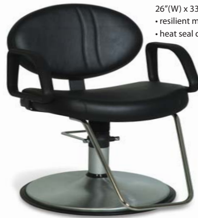
Calcutta All-Purpose Chair PSCL400AP-BL

26"(W) x 33"(D) x 35"(H) • resilient molded black armrests • heat seal design in back