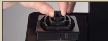
Added Value: Belvedere dryer hood filters are easy to access from the top of the dryer