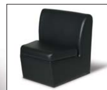
Newport Sofa Wedge