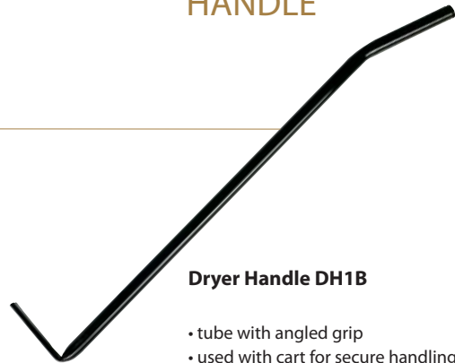
Dryer Handle DH1B