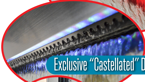
Exclusive "Castellated" Disperser