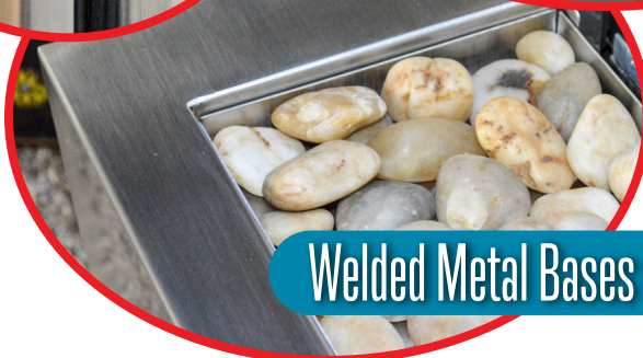
Welded Metal Bases with Polished Edges