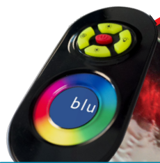
Standard LED Light Display System