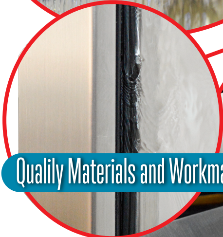
Quality Materials and Workmanship