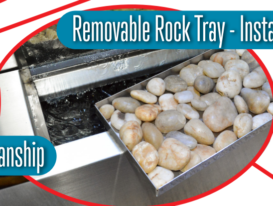
Removable Rock Tray - Instant Access