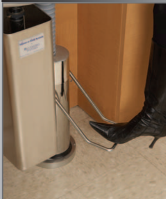
Easy-to-Use Foot Pump

The Adjust-a-Sink® is an ADJUSTABLE HEIGHT SHAMPOO BOWL that truly works! It can be easily adjusted a full 12" so that both the client and stylist experience the ultimate in Comfort and Accessibility.