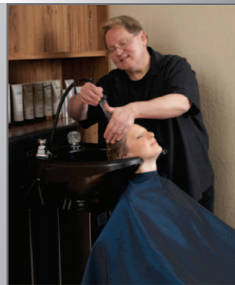
Works with Salon Chair