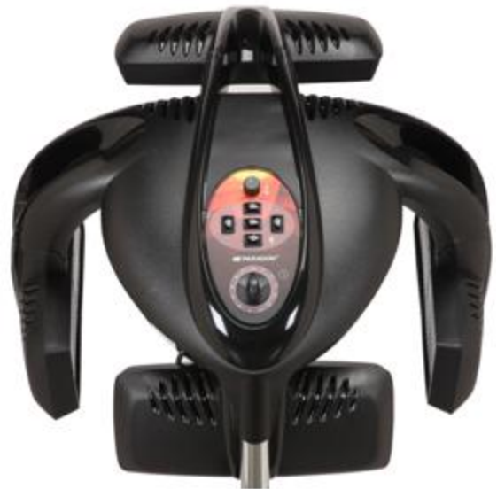
FIGURE 1. ASSEMBLY & PARTS LIST

CAUTION! DO NOT COMPRESS THE SPRING LOCATED IN THE TELESCOPING POLE UNTIL THE APPLIANCE HEAD IS ASSEMBLED TO THE STAND.