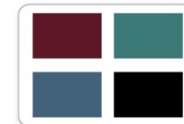
Nature's Touch 100% PU Upholstery