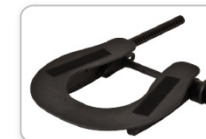
Deluxe Adjustable Facecradle