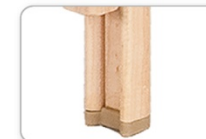
Non-slip, Stablefoot™ Traction Pads