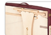
Maple Frame and Birch Decking