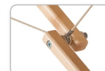
Mid-Brace™ 1000-lb Test Cables