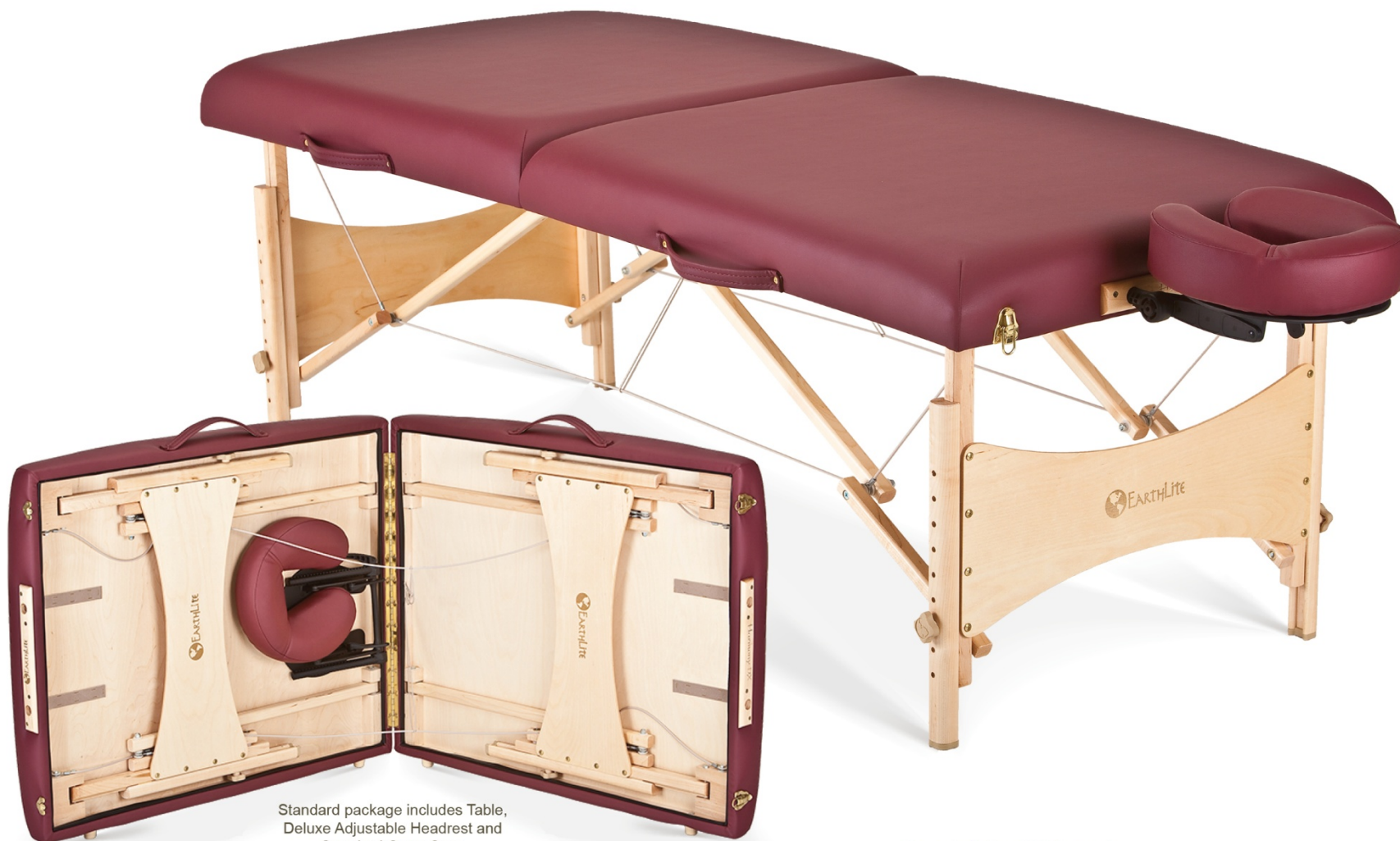
Standard package includes Table, Deluxe Adjustable Headrest and Standard Carry Case

The Harmony DX™ is crafted from managed-forest Hard Maple and finished with eco-friendly, water-based lacquers and glues. Layered with our lightweight, ultra-comfy 2½" cushioning system and wrapped in luxurious Nature's Touch upholstery, the Harmony DX™ embodies comfort, sustainability, and style. And it does all that at a price that won't break the bank.