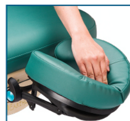
Flex-Rest Facecradle (Page 23 for more info.)