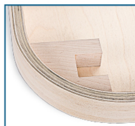
10-Layer Hoop Frame